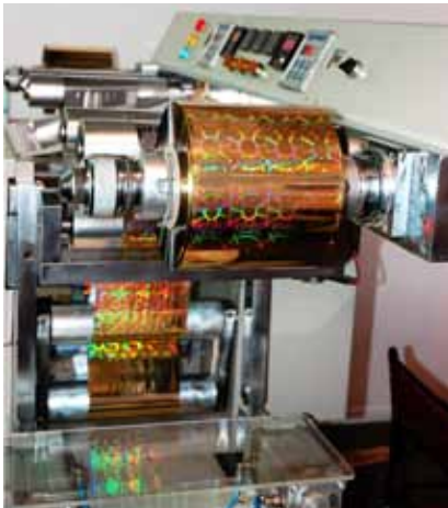
Narrow web Embossing Machine